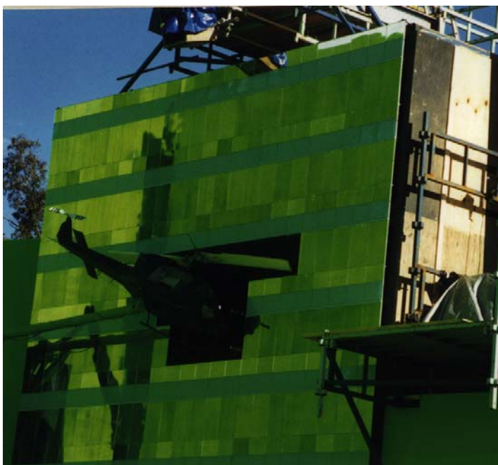
Helicopter on a swinging arm just prior to being swung into the glass front building.

a special effects explosion as part of the first Matrix film. A helicopter was to be crashed into the side of a skyscraper, exploding and shattering all the windows. In a